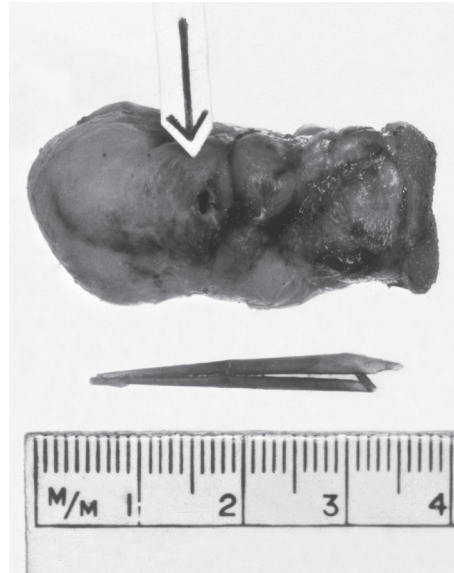
Figure 62.3 A Meckel's diverticulum perforated by a rolled up piece of tomato skin.

• Acute inflammation: Closely mimicking acute appendicitis. If the appendix is found to be normal at operation, the surgeon next looks for a possible Meckel's diverticulum.